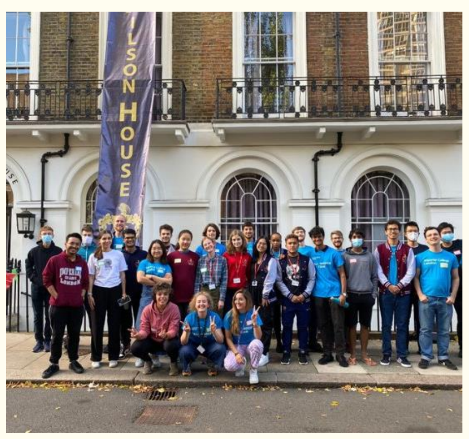
Photograph of Wilson House team