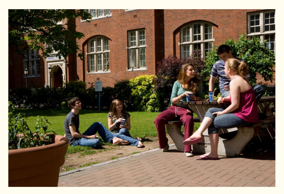
Photograph of Beit Quad