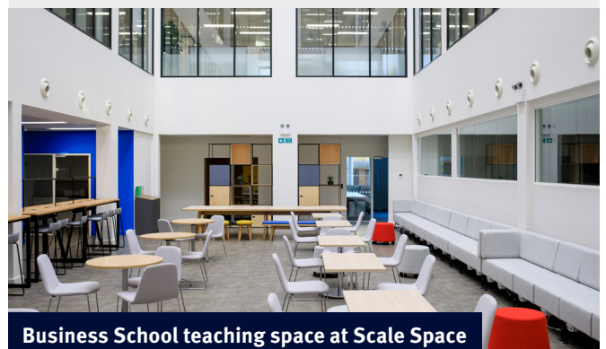
Business School teaching space at Scale Space