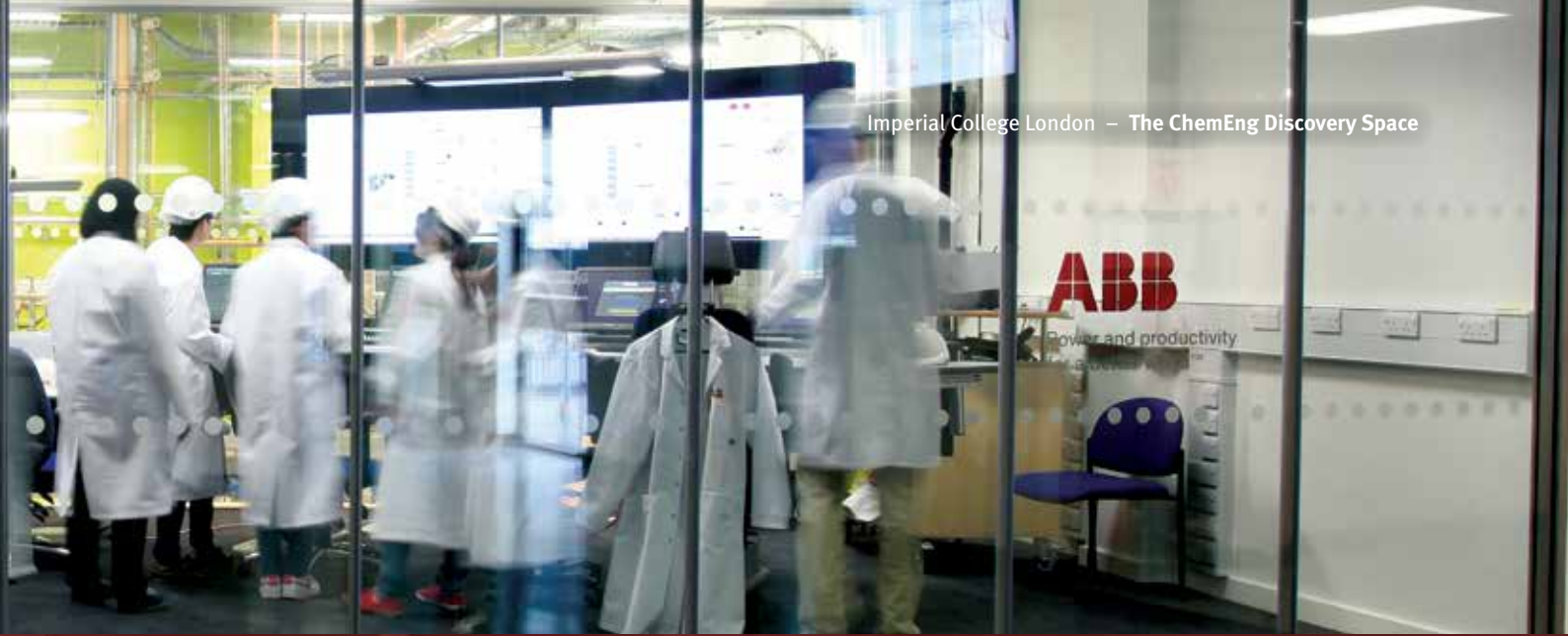
ABB Pilot Plant Control Room